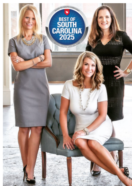
The MPA Executive Team

In 2024 and again in 2025, MPA was selected as the best marketing firm in South Carolina.