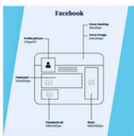
Facebook Post Sizing

Profile Photo: 2048 x 2048 pixels; ratio 1:1 Cover Photo: 2037 x 754 pixels; aspect ratio 2.7:1 (these can change seasonally) Your profile cover photo is the big landscape image at the top of your Facebook profile page. Most people use this image to show off their personality by showing themselves doing something they're passionate about. Use the highest resolution with the dimensions 2037 x 754 pixels.